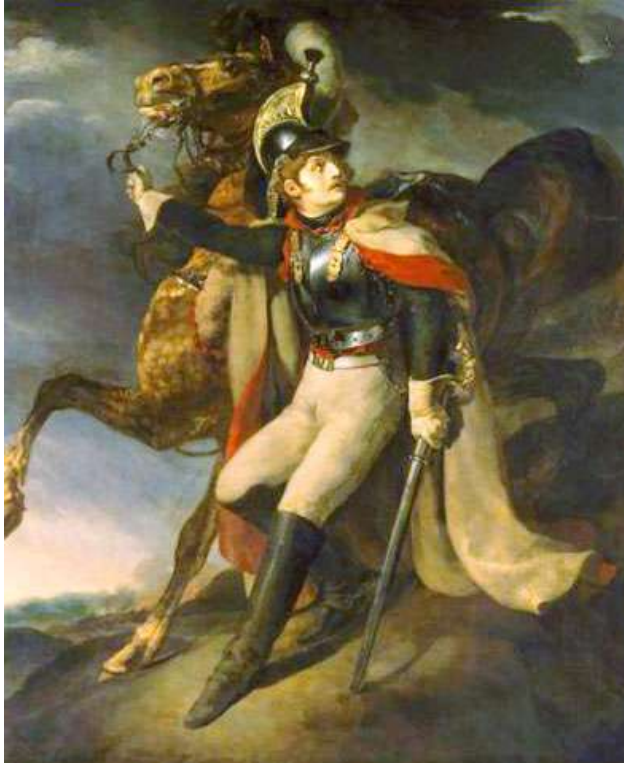
(Artist: Theodore Gericault Date: 1814)

I shall not be diverted from universal reality to mortal unreality. I have sensed the vibrations emanating from mother earth. I have sensed the vibrations emanating from water, fire and air. I have sensed the vibrations emanating from cosmic ether. Be sure! I shall not be bewildered by my scars and wounds.