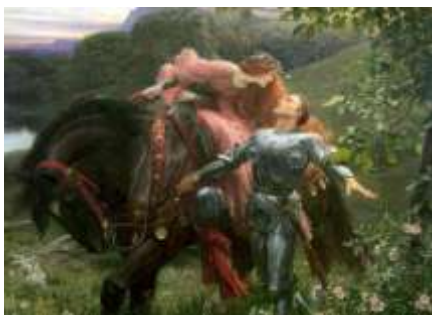
(Artist: Sir Frank Dicksee Date: 1853-1928)

Be sure! You shall recognise your divine prowess.