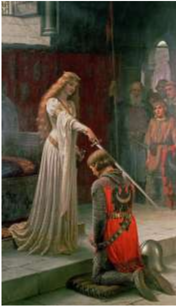
(Artist: Edmund Blair Leighton Date: 1901)

You shall not shrink from waging the divine struggle.