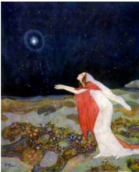
(Artist: Edmund Dulac Date: 1882-1953)

You shall not be ruffled by the joy of temporary success.