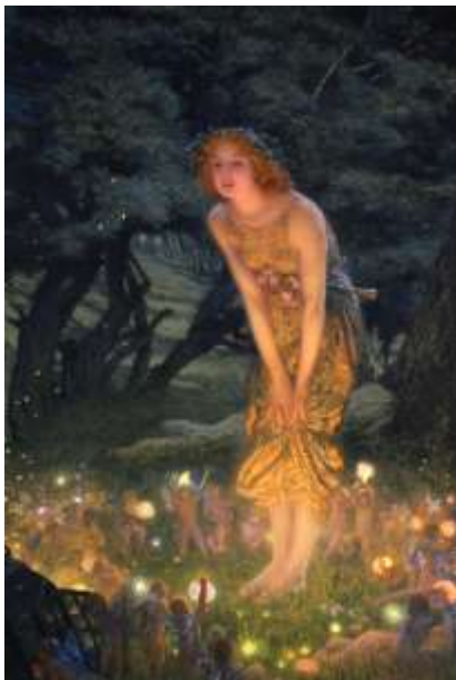
(Artist: Edward Robert Hughes Date: 1851-1914)

I shall overcome the lower states of my consciousness. I shall overcome the pull towards inert matter. I shall overcome my sense of separation. I shall overcome my desires and attachments. Be sure! I shall overcome the realm of darkness.