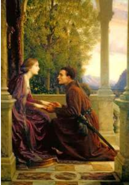
(Artist: Sir Frank Dicksee Date: 1921)

You shall not refuse to battle the enemy. You shall not refuse to conquer the inner enemy. You shall not fail to protect the inner kingdom of true happiness. You shall not shirk your righteous duty. You shall not shirk your true self. You shall not paralyze your heart. You shall not paralyze your soul. You shall be my spiritual warrior. You shall be my embattled warrior. You sense shall rejoice in true happiness. You shall not fight your true nature. You shall not fight your true happiness. You shall not be a slave of your senses. You shall be governed by the wisdom of the self.