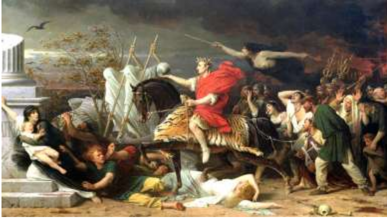
(Artist: Adolphe Yvon Date: 1875)

I shall not be beleaguered by my defeats.