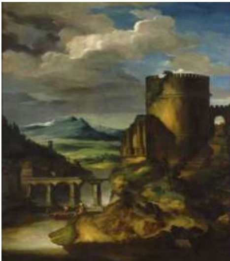
(Artist: Theodore Gericault Date: 1791-1824)

I shall not be deaf to the subtle warnings. I shall not be deaf to subtle criticism. I shall receive criticism with a sense of gratitude. I shall not be deluded by mortal praises. Be sure! I shall overcome the realm of darkness.